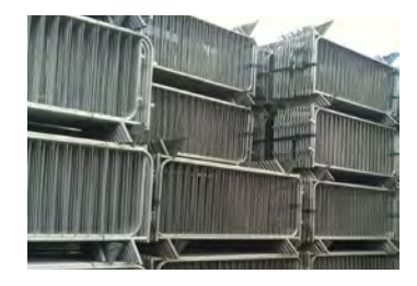
CROWD CONTROL BARRIER PACKAGE