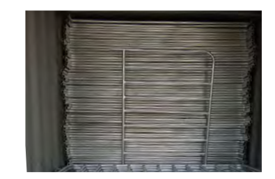
CROWD CONTROL BARRIER DELIVERY