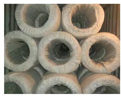
PVC COATED WIRES LOADING