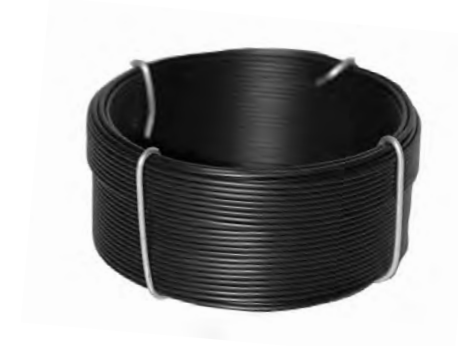
PE Coated Wire