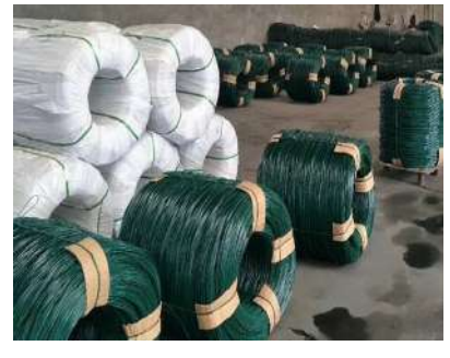
PVC COATED WIRE IN THE WAREHOUSE