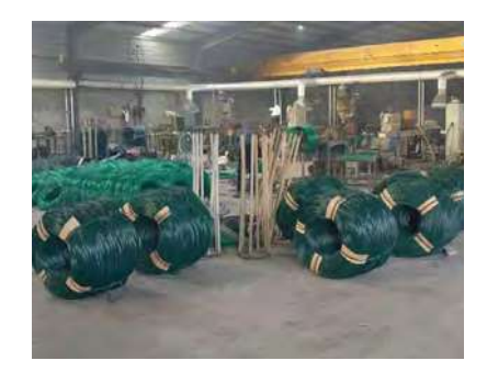
PVC COATED WIRE PRODUCTION